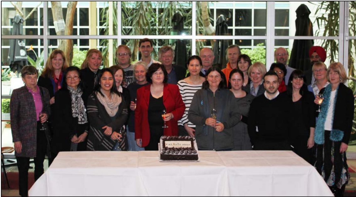
Library staff celebrating the conclusion of the 4-year Alma project