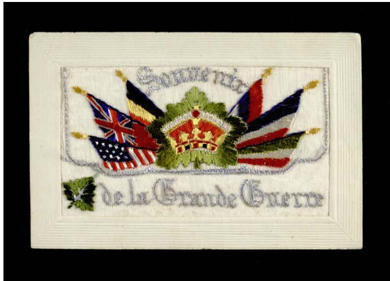
Needlepoint: Souvenir de la Grande Guerre ( Souvenir of the Great War ) http://arrow.monash.edu.au/hdl/1959.1/966951

In August the Library launched its first ongoing Rare Books virtual exhibition, designed to focus on World War One over four years from the anniversary of the declaration of war. The exhibition, entitled A new nation goes to war , is an online showcase of materials held in the Rare Books collection. It will be augmented each year with new material including contemporary publications, manuscript items and realia, with the aim of presenting the war as it was understood by Australians at home, soldiers overseas and children of the era.