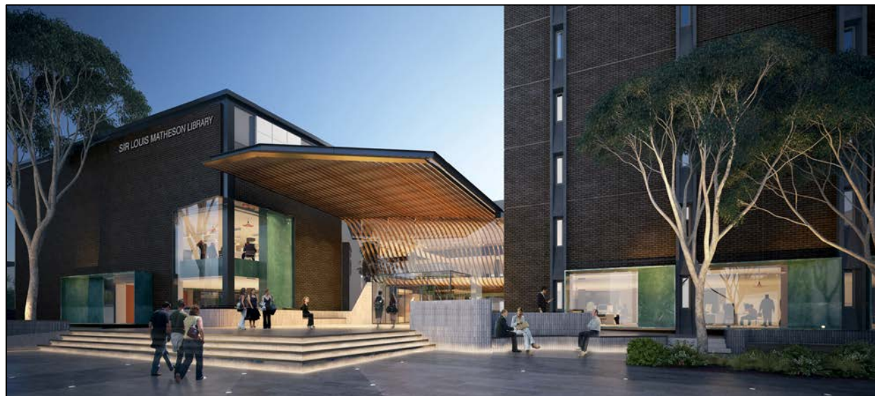
Transforming the Matheson Library

Following the Vice Chancellor's announcement of funding for the refurbishment of the Sir Louis Matheson Library and subsequently the Caulfield Library, designs for both projects were developed in collaboration with the successful architects, Cox Architecture and John Wardle Architects respectively. The design for the Matheson Library was endorsed by the University in time for building works to begin before the end of the year.