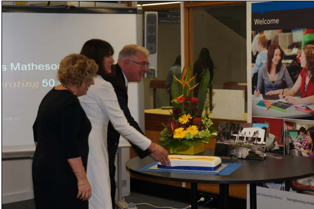
Cutting the anniversary cake